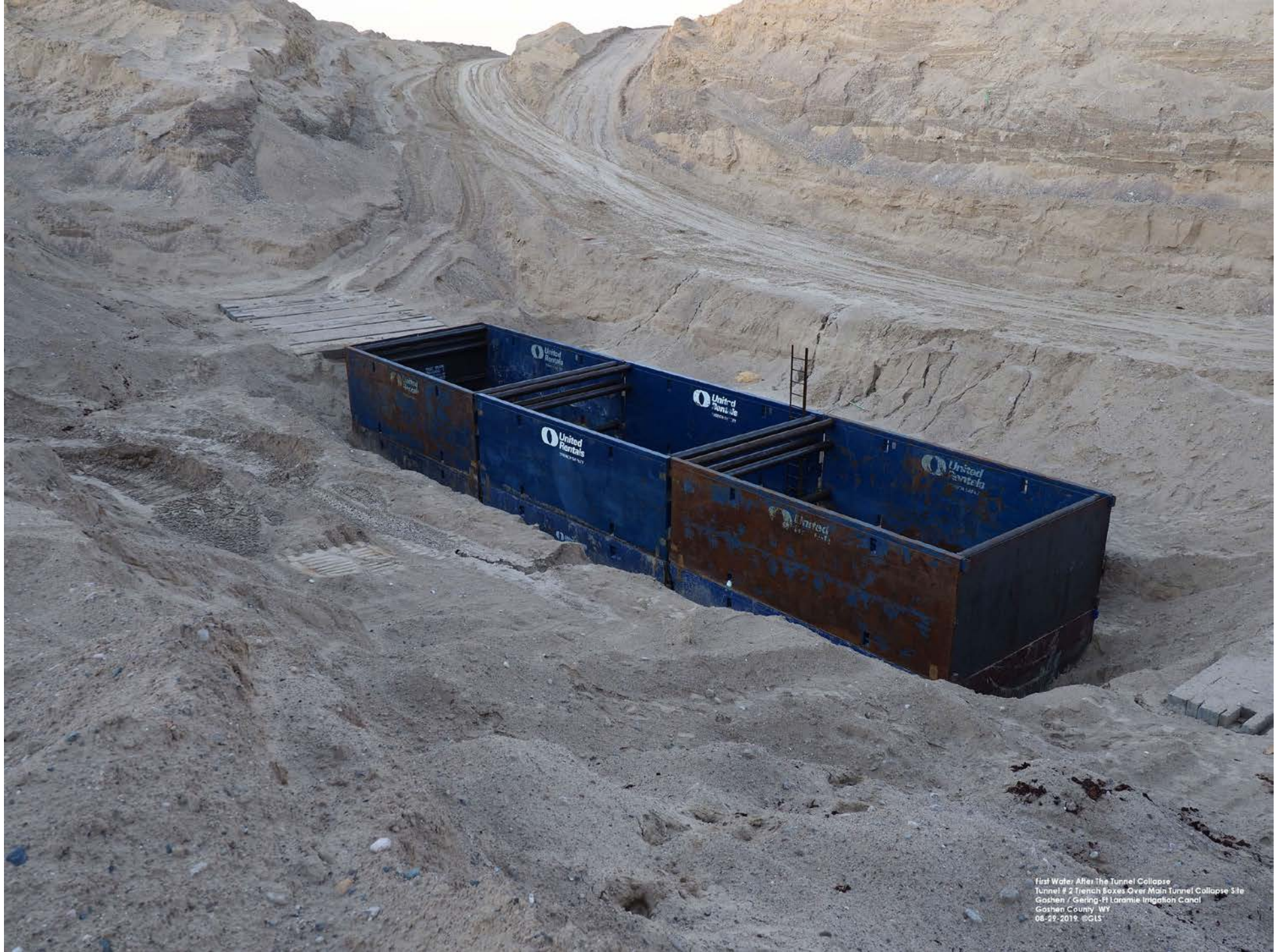
First Water After the Tunnel Collapse Tunnel # 2 Trench Boxes Over Main Tunnel Collapse Site Goshen / Casings #1 Laramie Irrigation Canal Goshen County WY 08-29-2018