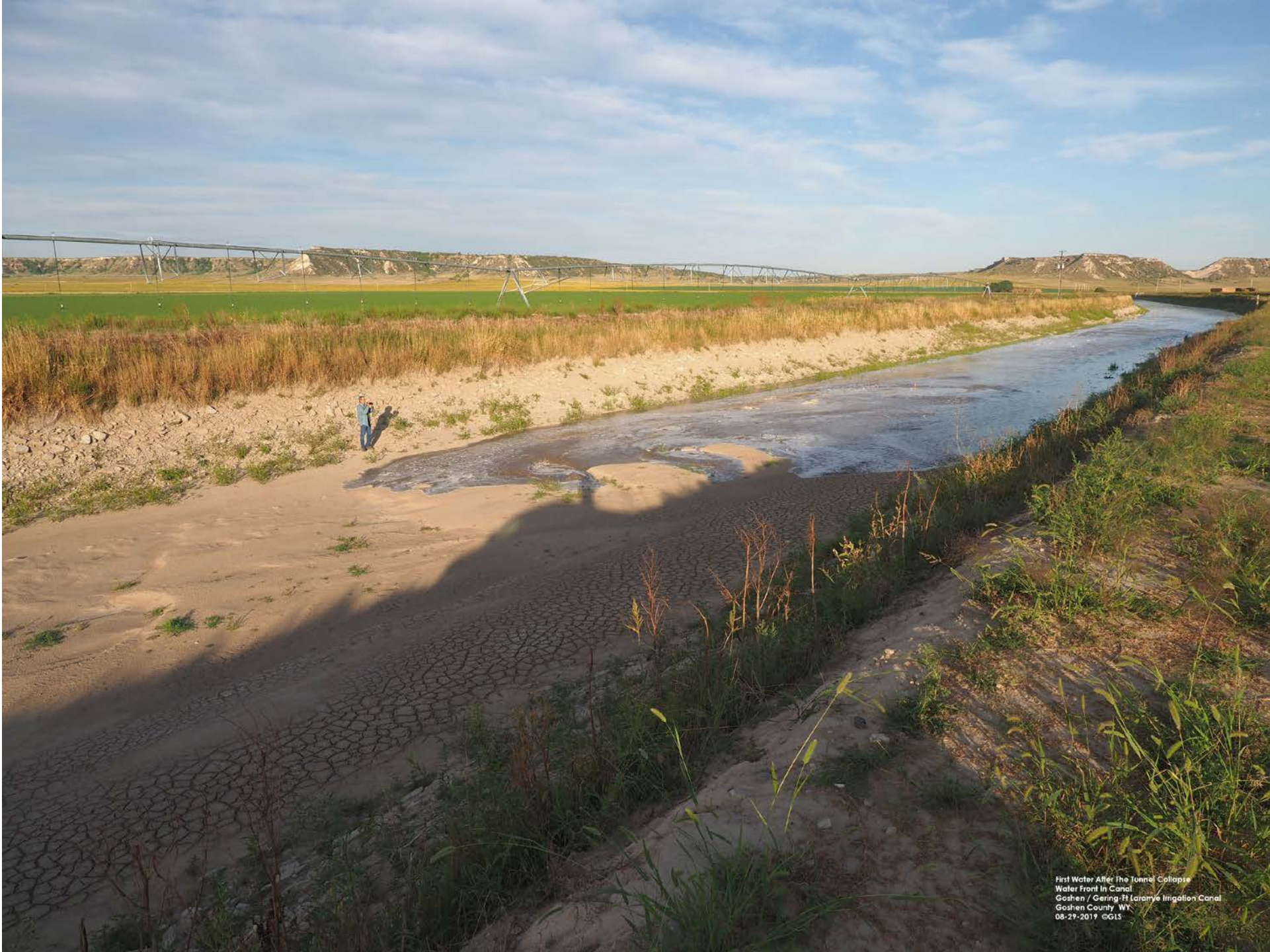
First Water After The Tunnel Collapse Water Front in Canal Goshen / Geering / Laramie Irrigation Canal Goshen County, WY 08-29-2019