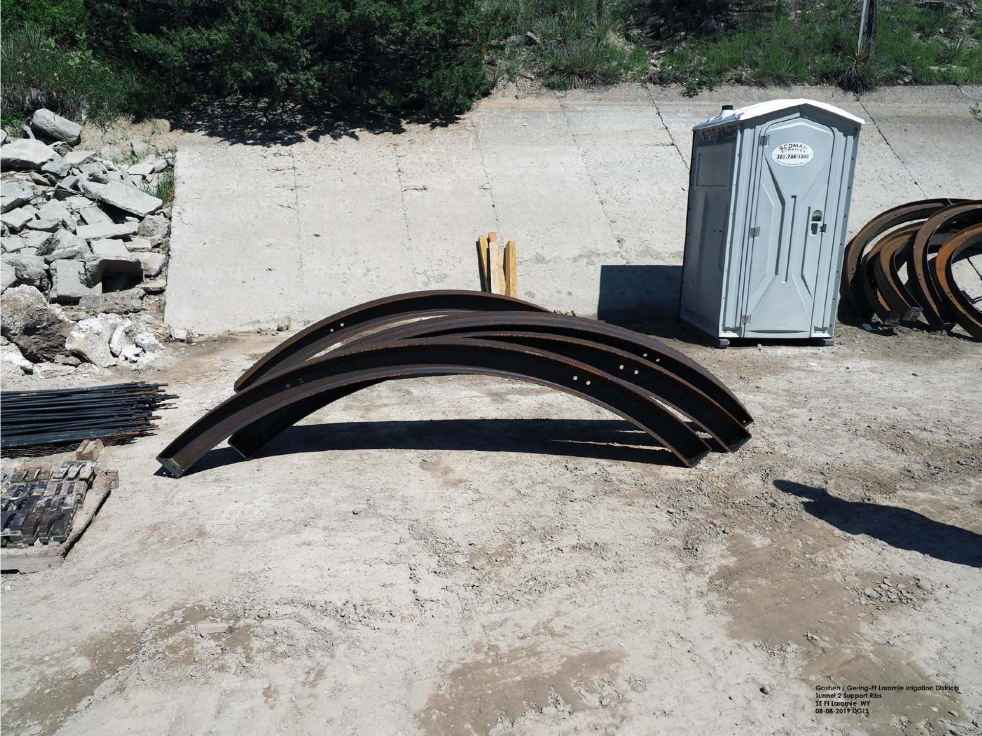
Goshen / Gering-F1 Laramie Irrigation District Tunnel 2 Support Ribs SE F1 Laramie WY 08-08-2019 G15