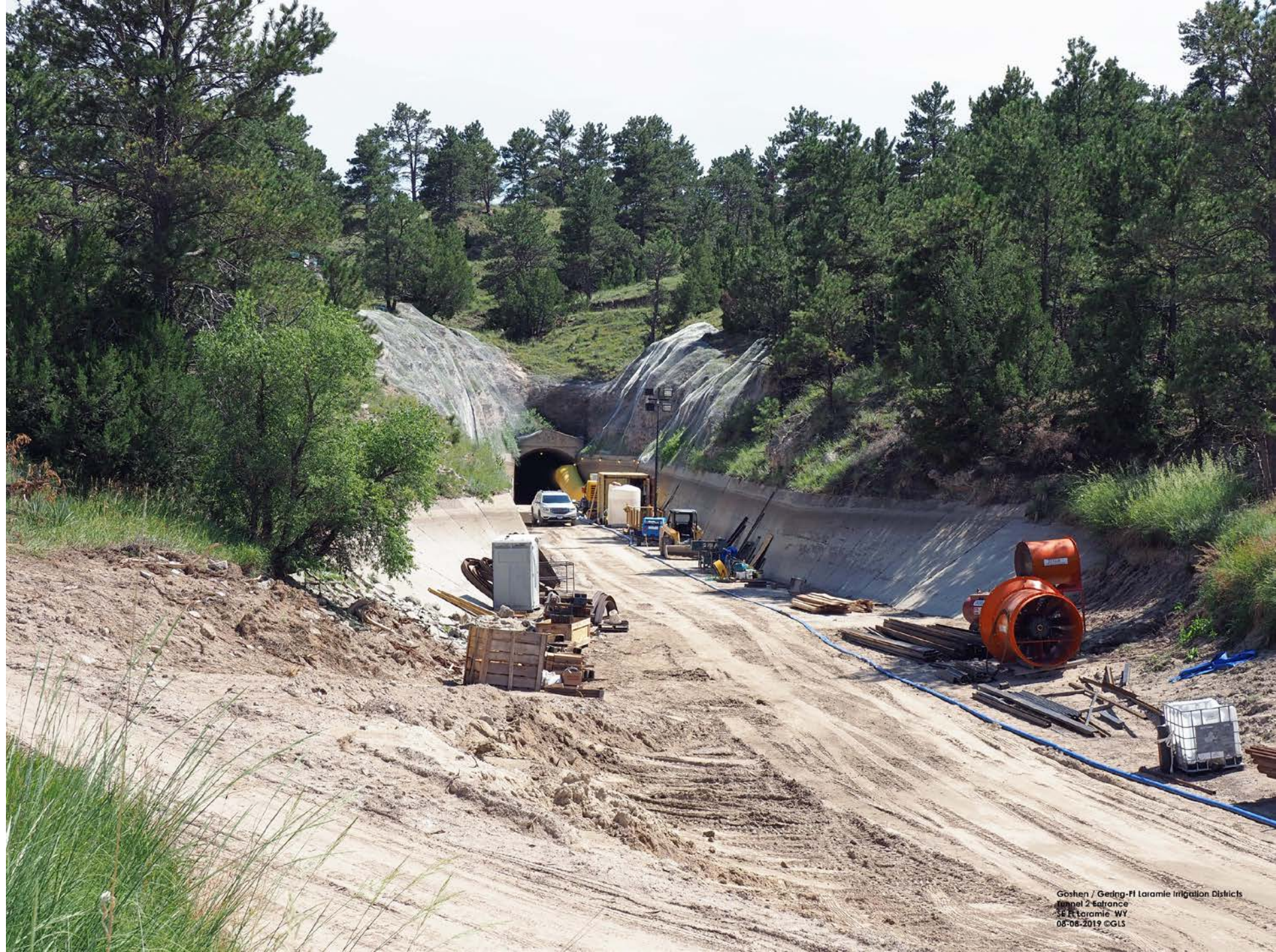
Goshen / Gedong-F1 Laramie Irrigation Districts Tunnel 2 Entrance SE Laramie WY 08-08-2019