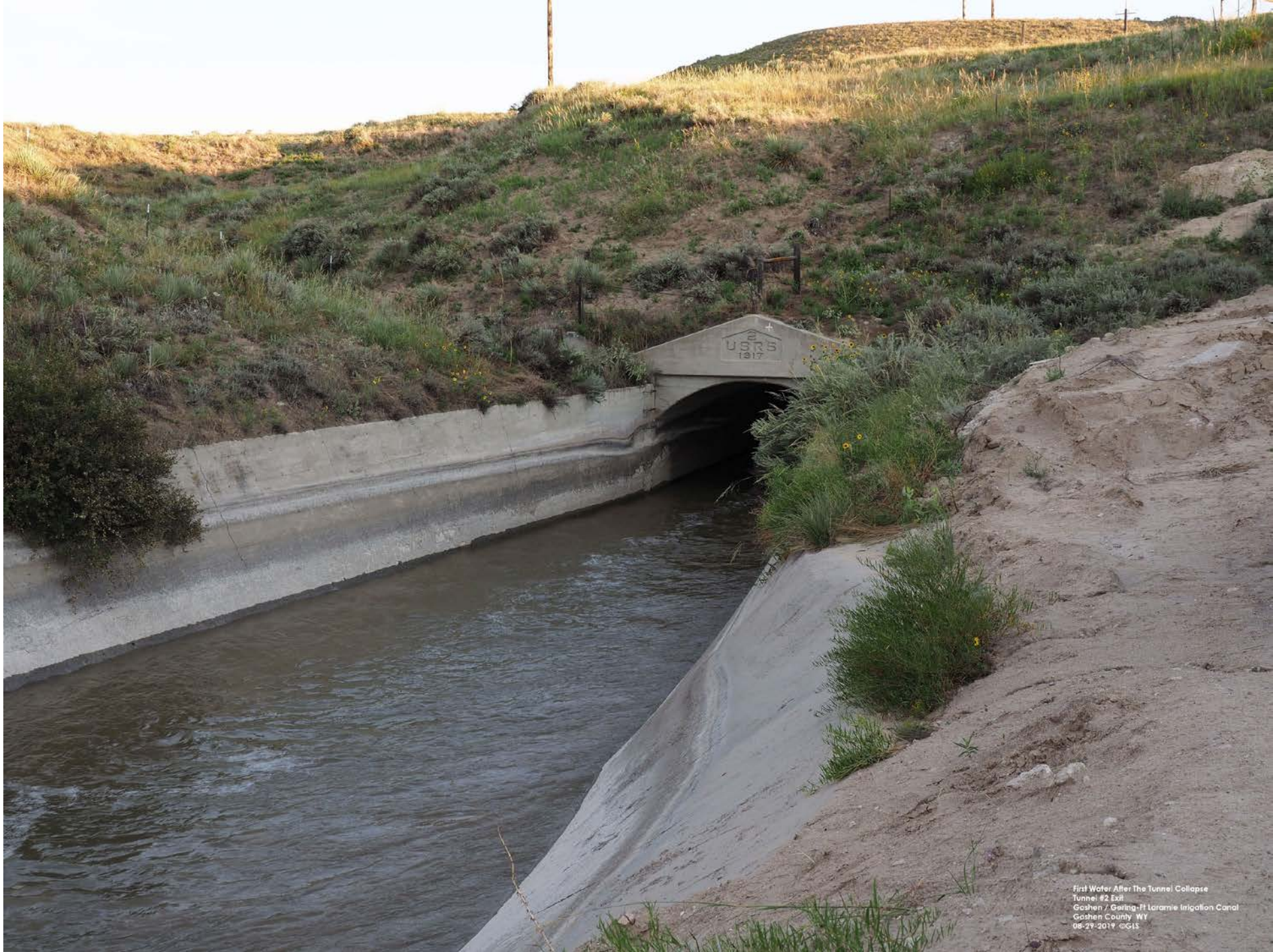
First Wafer After The Tunnel Collapse Tunnel #2 Exit Goshen / Goring Ft Laramie Irrigation Canal Goshen County WY 08-29-2019