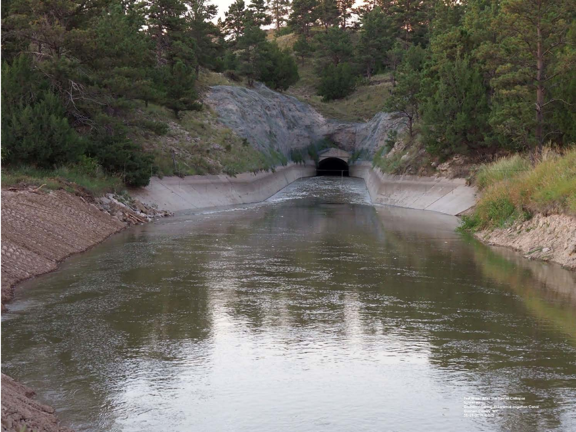
Final Water After The Tunnel Collapse Summer 2019 Goshute-Gardner El Laramie Irrigation Canal Goshute County, NV 08-29-2019 16:51