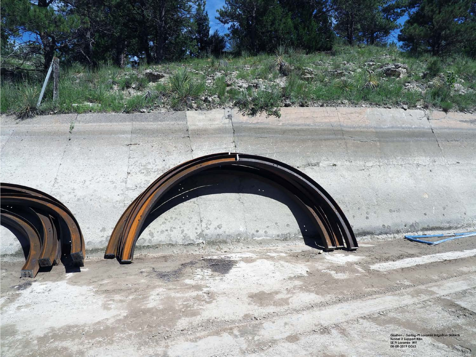
Goshen / Gering-Ft Laramie Irrigation Districts Tunnel 2 Support Ribs SE Ft Laramie, WY 08-08-2019