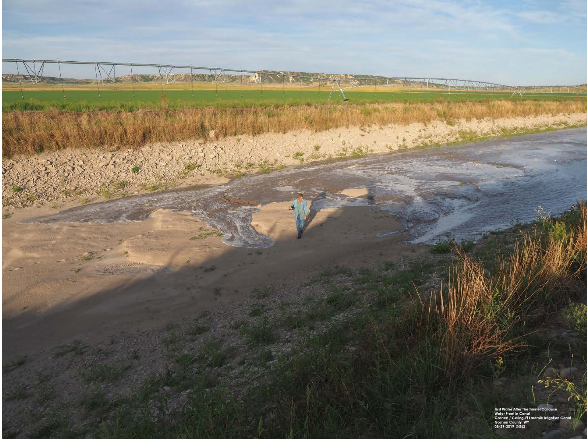
First Water After The Tunnel Collapse Water Front In Canal Goshen / Geering-Fl Laramie Irrigation Canal Goshen County WY 08-29-2019