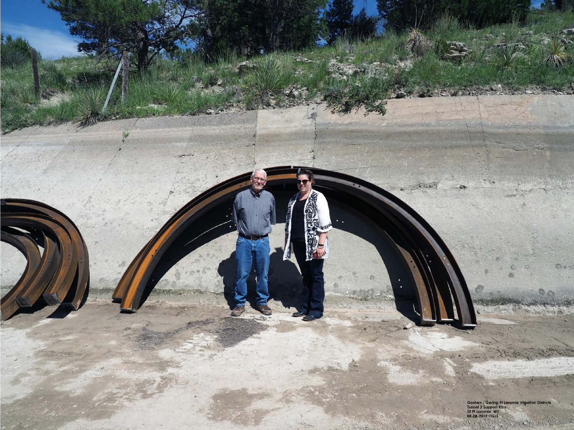
Goshen / Gering Ft Laramie Irrigation Districts Tunnel 2 Support Ribs SE Ft Laramie, WY 08-08-2019