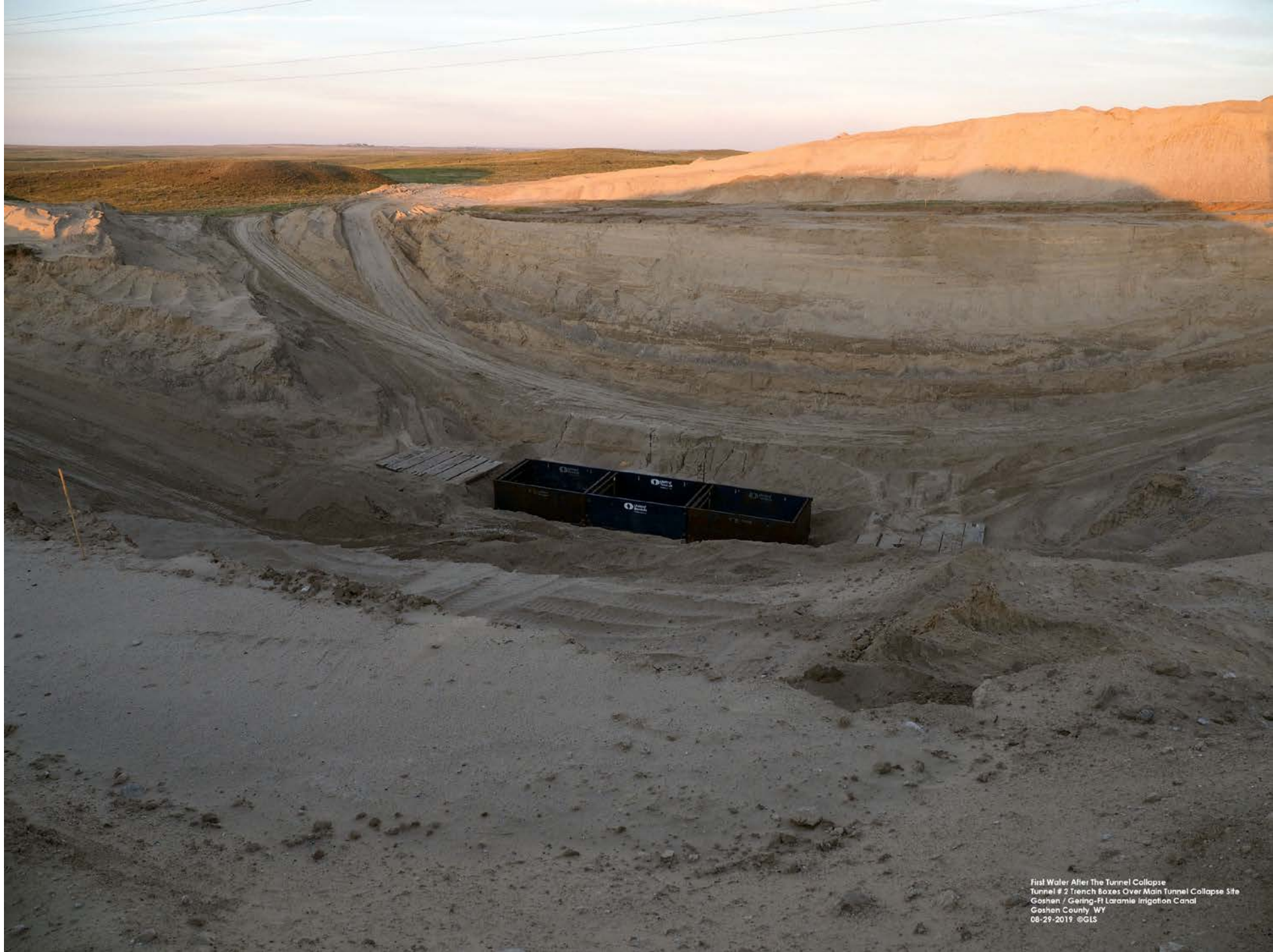
First Water After The Tunnel Collapse Tunnel # 2 Trench Boxes Over Main Tunnel Collapse Site Goshen / Gering-R Laramie Irrigation Canal Goshen County WY 08-29-2019