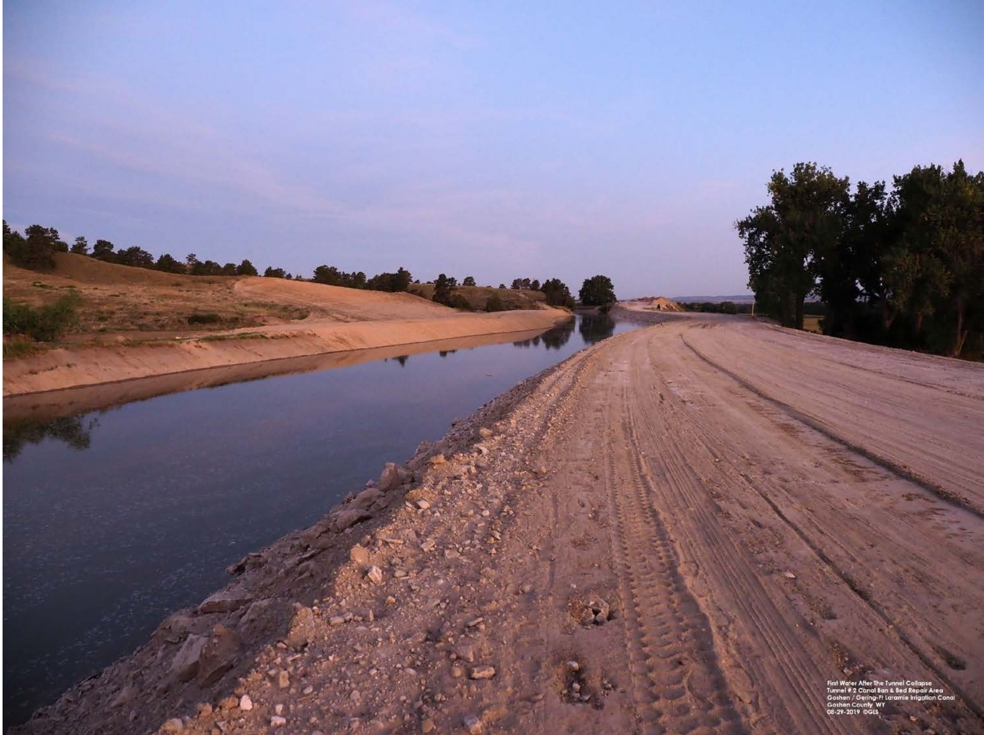
First Water After The Tunnel Collapse Tunnel # 2 Canal Ban & Bed Repair Area Goshen / Gering-Ft Laramie Irrigation Canal Goshen County, WY 08-29-2019