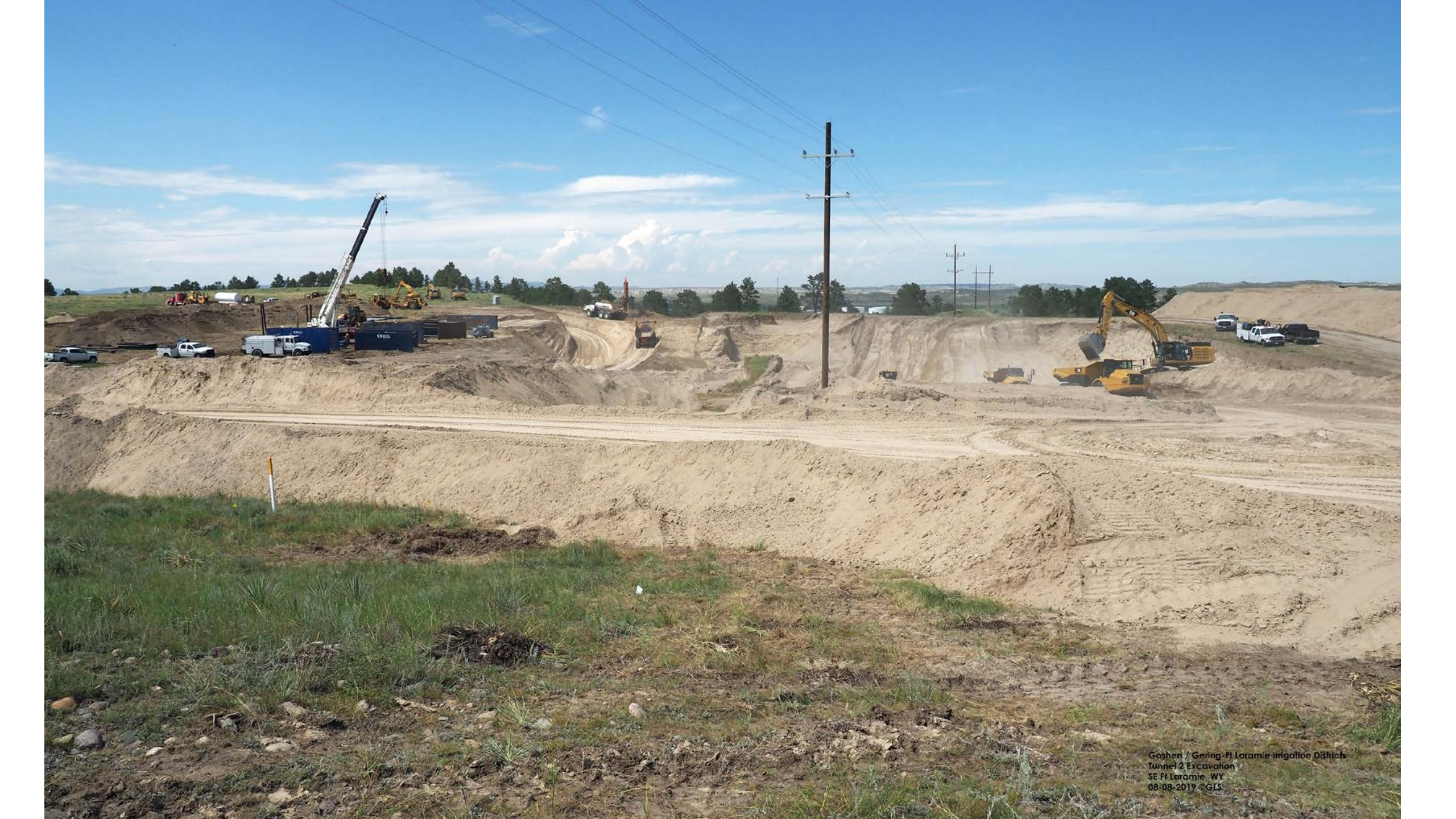
Goshen / Gering Ft. Laramie Irrigation Districts Tunnel 2 Excavation SE Ft. Laramie, WY 08-08-2019