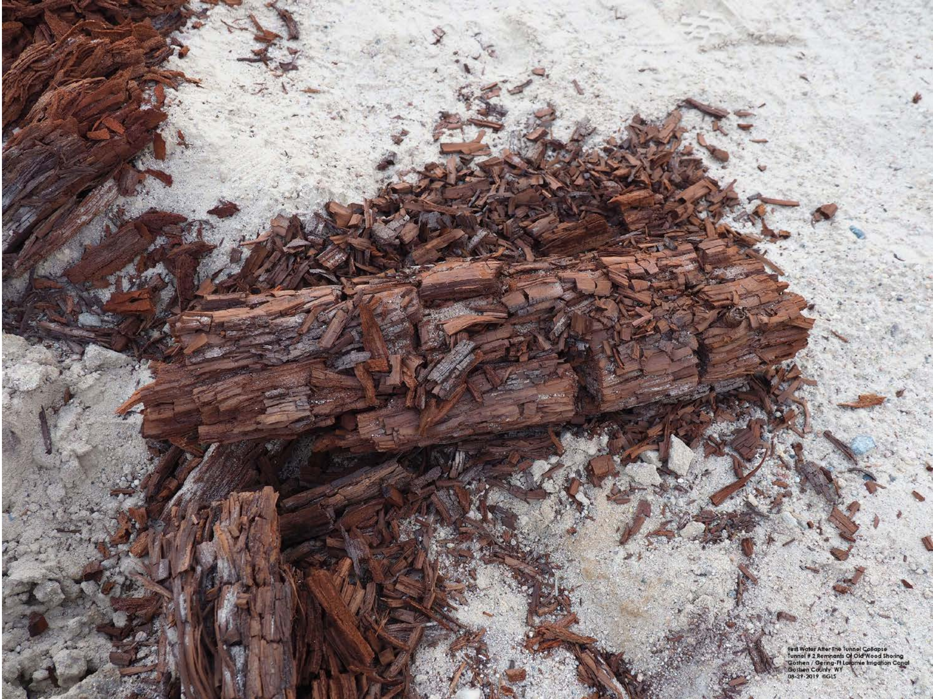
First Water After The Tunnel Collapse Tunnel # 2 Remnants Of Old Wood Shoring Goshen / Gering-Ft Laramie Irrigation Canal Goshen County WY 08-27-2019