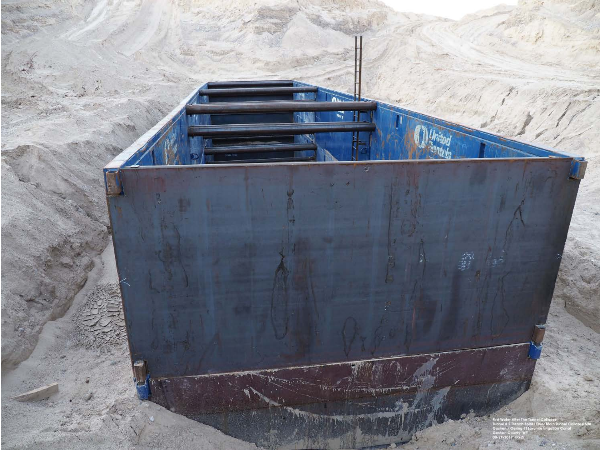
First Water After The Tunnel Collapse Tunnel # 2 Trench Boxes Over Main Tunnel Collapse Site Goshen / Garing Fl Laramie Irrigation Canal Goshen County WY 08-29-2019